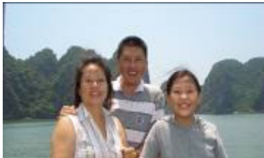
The Lo family Indonesia